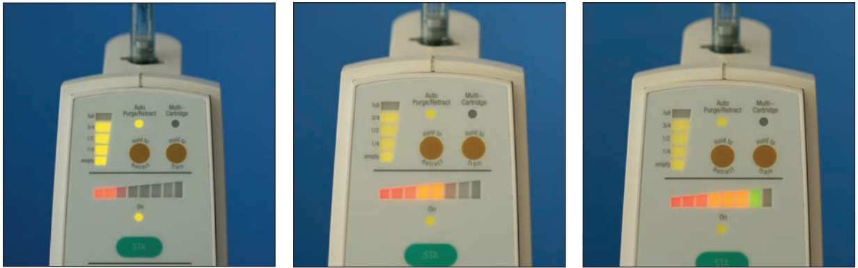
Figures 3A - 3C —The STA-System real-time feedback is an audible and a visual pressure sensing scale. The visual scale is displayed on the front panel, composed of a series of LED lights—orange, yellow, and green. The orange lights indicate minimal pressure (Figure 3A), the yellow indicate mild to moderate pressure (Figure 3B), and the green indicate moderate pressure (Figure 3C), indicative of the PDL tissue.

only the STA 1-speed mode should be used when performing this intraligamentary injection.