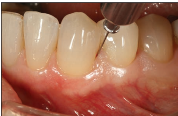
Figure 1 —The standard periodontal ligament (PDL) technique uses a “blind” approach and placement of the needle into the PDL. The traditional technique relies on subjective “feel” of the operator.

odontal ligament (PDL) injection technique, 7,8 which uses a standard dental syringe and consists of “blind” placement of a hollow-bore metal needle into the gingival sulcus, followed by advancing the needle into the PDL located between the root surface (cementum) and the bony socket of a tooth 9-14 (Figure 1). The technique is understood today as a nontrephinating intraosseous injection.